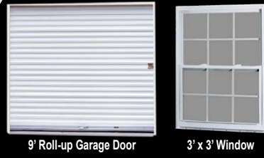
9' Roll-up Garage Door 3' x 3' Window