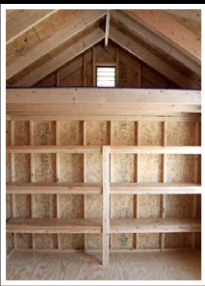
Example of Shelving