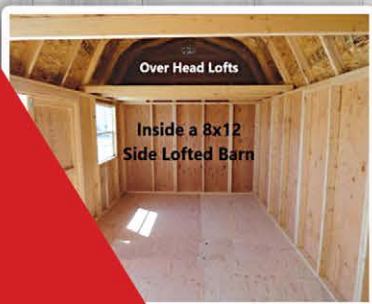
Over Head Lofts