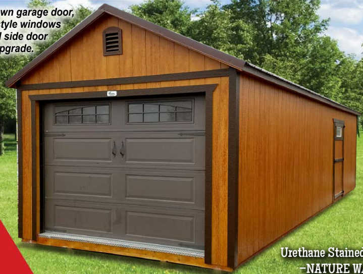
Urethane Stained Finish - NATURE WALK

*Brown garage door, Carriage style windows on garage door and side door are an optional upgrade.