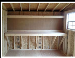
Example of Workbench