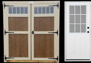
Transom Windows added to Wooden Doors 9 Lite 36" Door